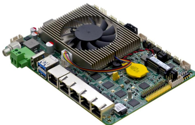
EPIC-W81P4 VER:1.1 主板侧面图