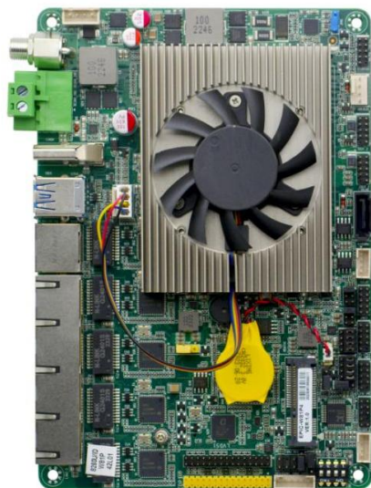
EPIC-W81P4 VER1.1 主板正面图