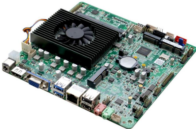
ITX-B101_C312L VER:0.3 主板侧面图