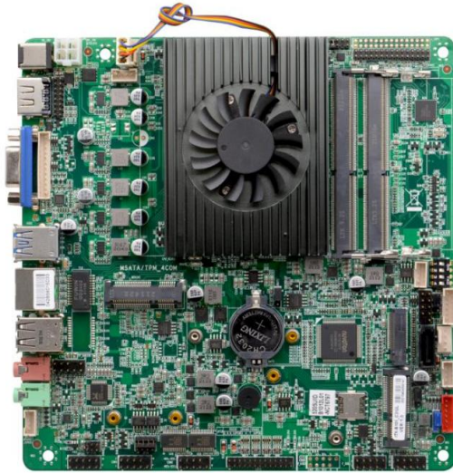
ITX-B101_C312L VER:0.3 主板正面图