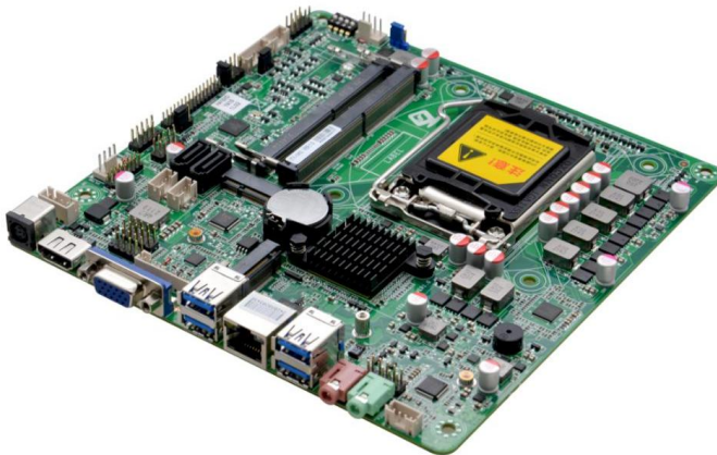
ITX-Y410 VER:1.0 主板侧面图