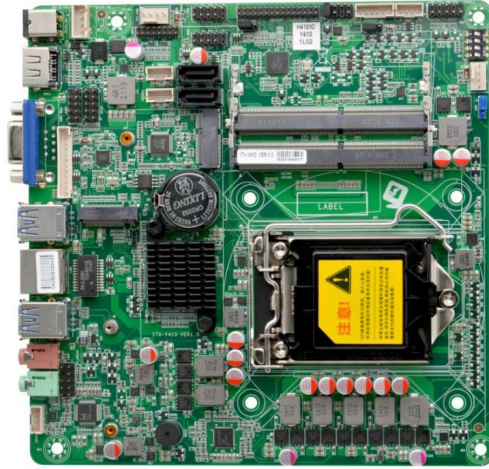
ITX-Y410 VER:1.0 主板正面图