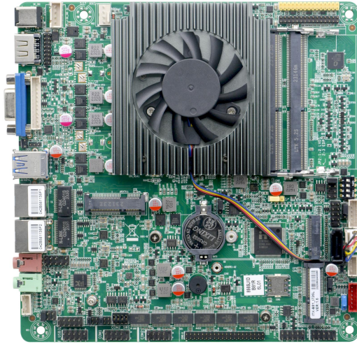
ITX-B81_I526L VER:1.6 主板正面图