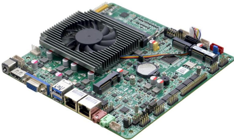
ITX-B181_I526L VER:1.6 主板侧面图