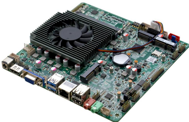
ITX-B101_I512L VER:1.1 主板侧面图